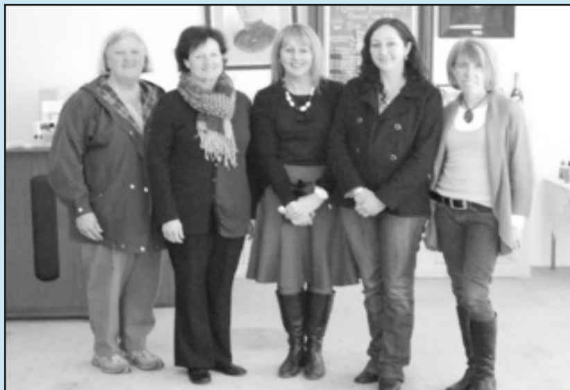
A group of volunteers and supporters visiting the Adelaide Office. They are greatly appreciated!

S outh Australia Brighton Union members once again held a Christmas Luncheon for those feeling alone, have a need or just feeling "down". Beautifully knitted gifts made or donated by WCTU members plus a parcel of baby lotions, wipes, etc. were this year given to "Genesis Pregnancy Support".