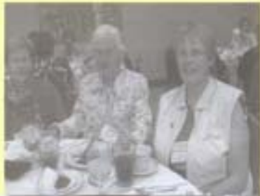
from Iceland ...