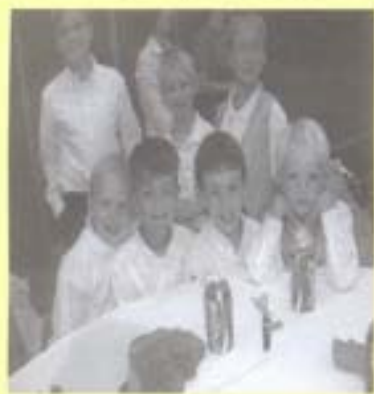
These boys from 'Amazin' Praisin'