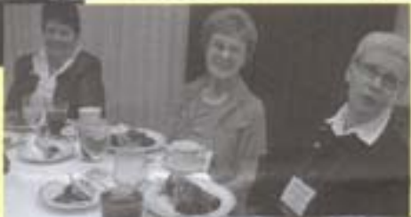
and Korea, Germany, US and Finland