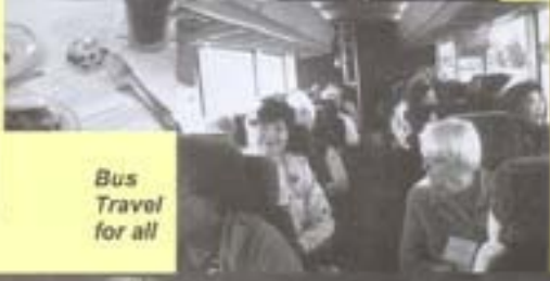
Bus Travel for all