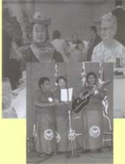
Talent Night was popular