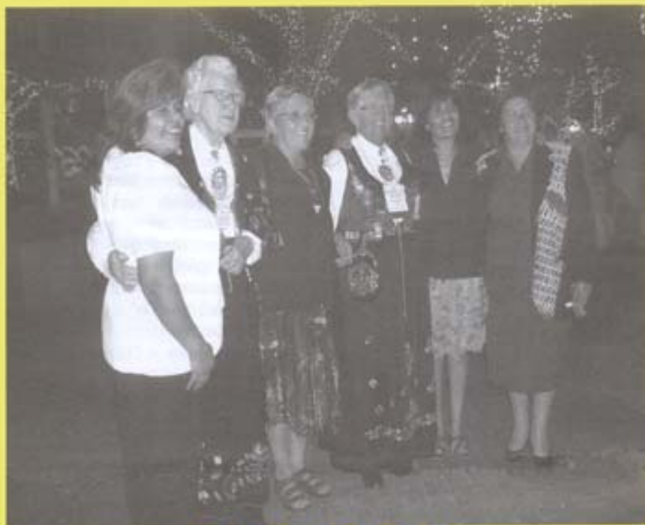
Together- delegates outside Christ Church Cathedral, Indianapolis following worship. Lighted trees in the background.