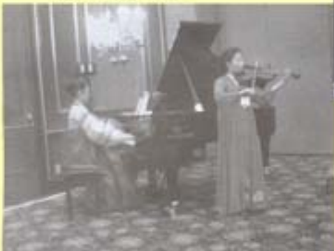
With music from Koreans and others