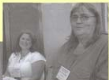
and support from Canada