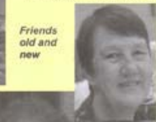
Friends old and new